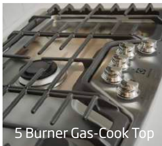
5 Burner Gas-Cook Top